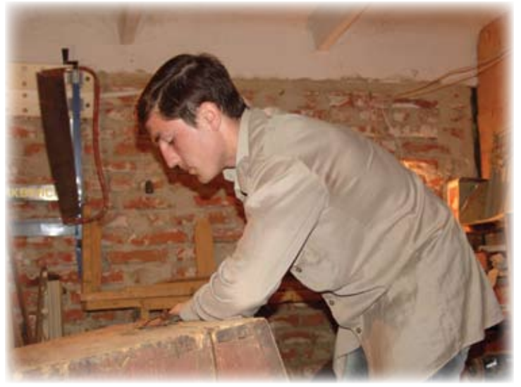
Participants of the Ecumenical Social Week visited a transitional center where formerly homeless people renovate discarded furniture.

"Initiatives like this are extraordinarily important, for they help revive the traditions of philanthropy in Ukraine,