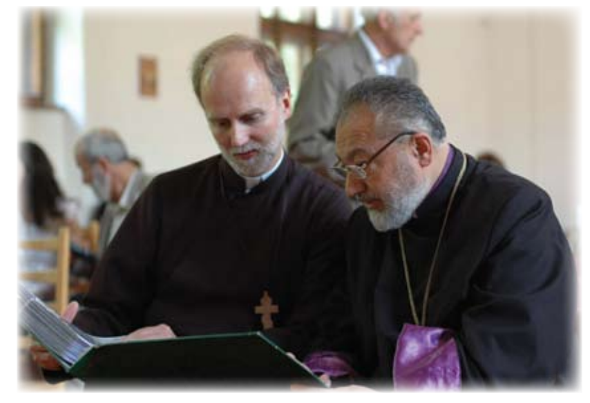
Archbishop Grigoris Buniatian, the head of the Ukrainian Diocese of the Armenian Apostolic Church, visited UCU and participated in an international conference dedicated to Ukrainian-Armenian relations.

"Today, as we look on various aspects of the activities of Armenians on the territory of Ukraine, including from