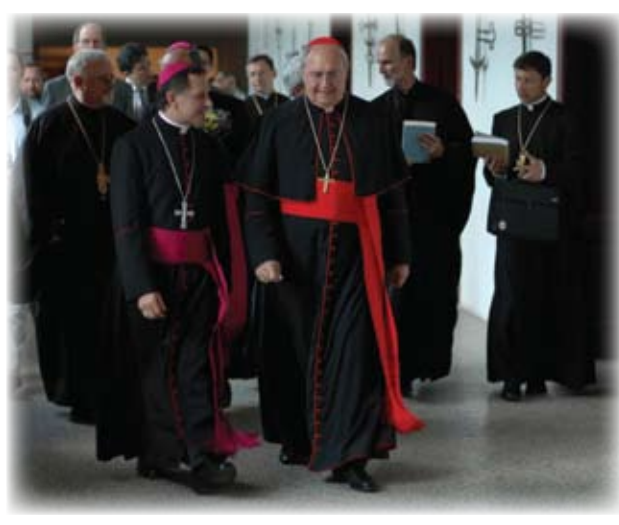
"In the 20th century Western civilization 'soaked up' certain prejudices. UCU can make its contribution in overcoming these, inasmuch as it is able to propose to both East and West important truths."

Leonardo Cardinal Sandri, Prefect of the Congregation for the Oriental Churches, during his visit