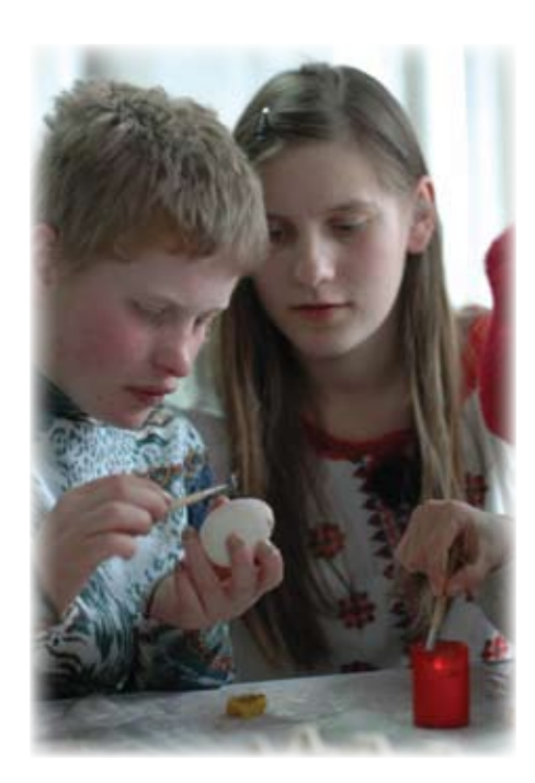
Students of social pedagogy visit orphans in institutions, including at Easter.

The students have begun their work with enthusiasm, for it demands not only knowledge but also the ability to work with children who need special